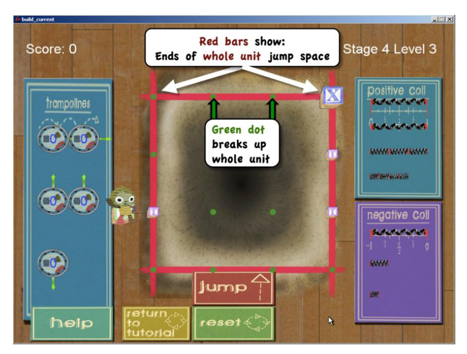
Figure 1 . The intersection of the vertical bars depicted the boundaries of the whole unit. The green dots broke up the whole unit into intervals.

Once the students figured out the unit size of the spaces on the grid, they had to add together the correct number of coils that will span the distance to jump over. For example, in Figure 2, to get safely from one block to the next, Patch needs to jump over three one-third-unit intervals. This means that to successfully make it to the next block, the trampoline must contain three one-third-unit-sized coils. If the trampolines did not contain the correct number or size of coils necessary to get Patch to the next block, Patch exploded into feathers and the students were allowed to replay the level. To reinforce the idea that only fractions with like denominators can be added together, the student could not combine coils that have different unit sizes. If a student had a trampoline with a one-third coil on it and tried to add a one-sixth coil, the one-sixth coil would not go onto the trampoline.