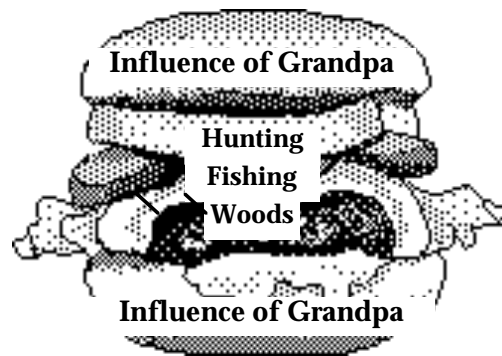
Figure 2. You’ve got to build a triple-decker cheeseburger.